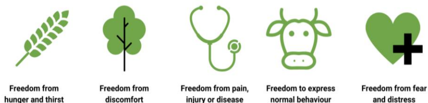
Picture 3: The 5 freedoms of animal welfare